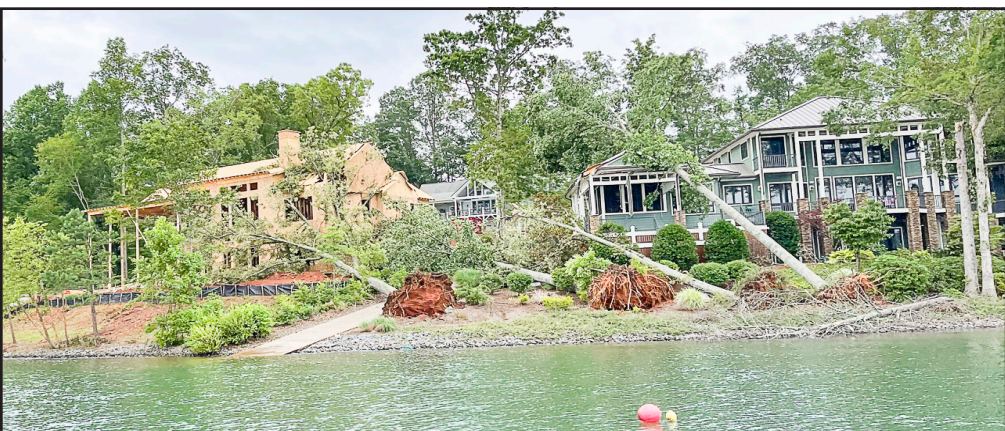
Several homes on Lake Chatuge received damage in the July 2 thunderstorm.