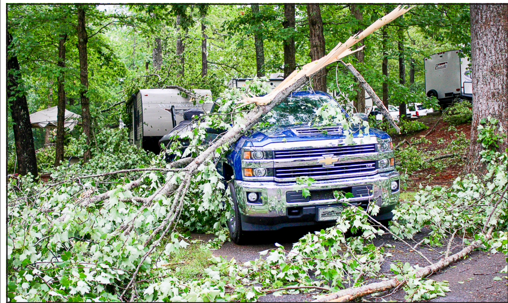
The Georgia Mountain Fairgrounds experienced quite a bit of storm damage last week – the most since Hurricane Opal in 1995.