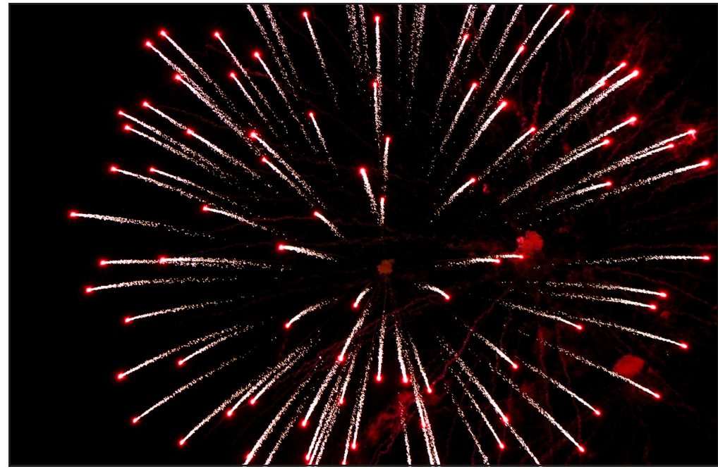
The Georgia Mountain Fairgrounds offered the public a patriotic good time at the free annual fireworks display on America’s 247th birthday last week.