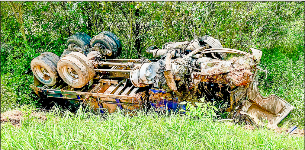
This fully loaded dump truck driving up from the direction of Helen crashed into two pickups before going over the side of the Unicoi Turnpike Friday.

By Shawn Jarrard Towns County Herald Editor