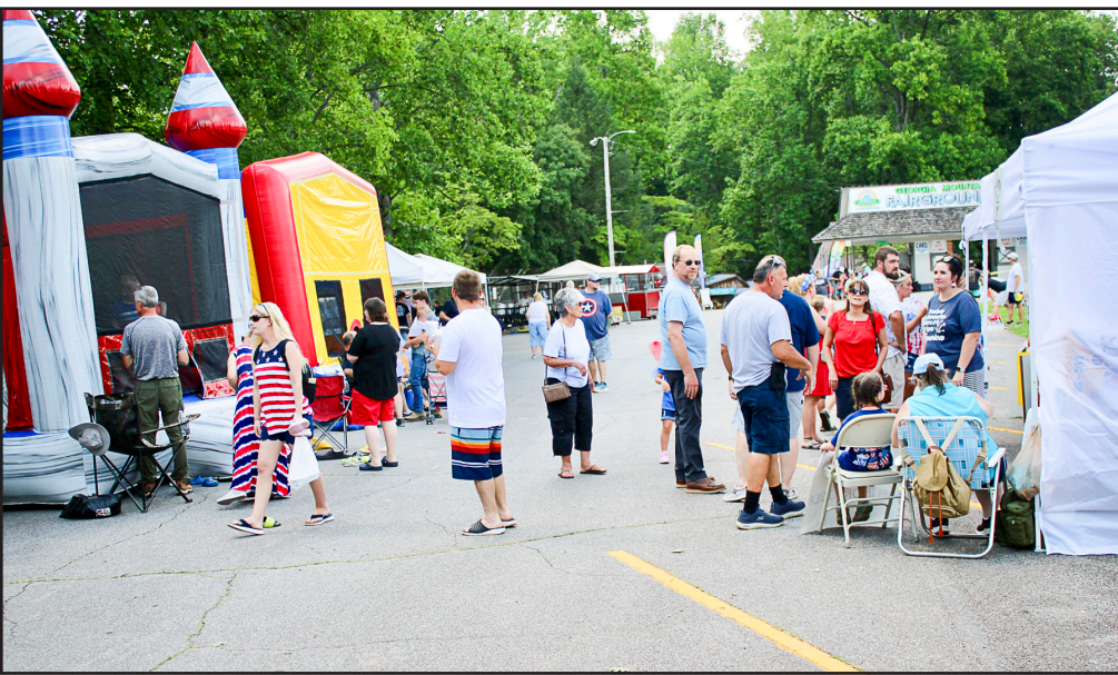
Families had plenty to do in addition to fireworks at the Georgia Mountain Fairgrounds for Independence Day 2023.

and sold homemade cinnamon rolls to raise money for an upcoming mission trip, and attendees cooled off with ice cream and shaved ice, with many enjoying delicious barbecue and other food options.